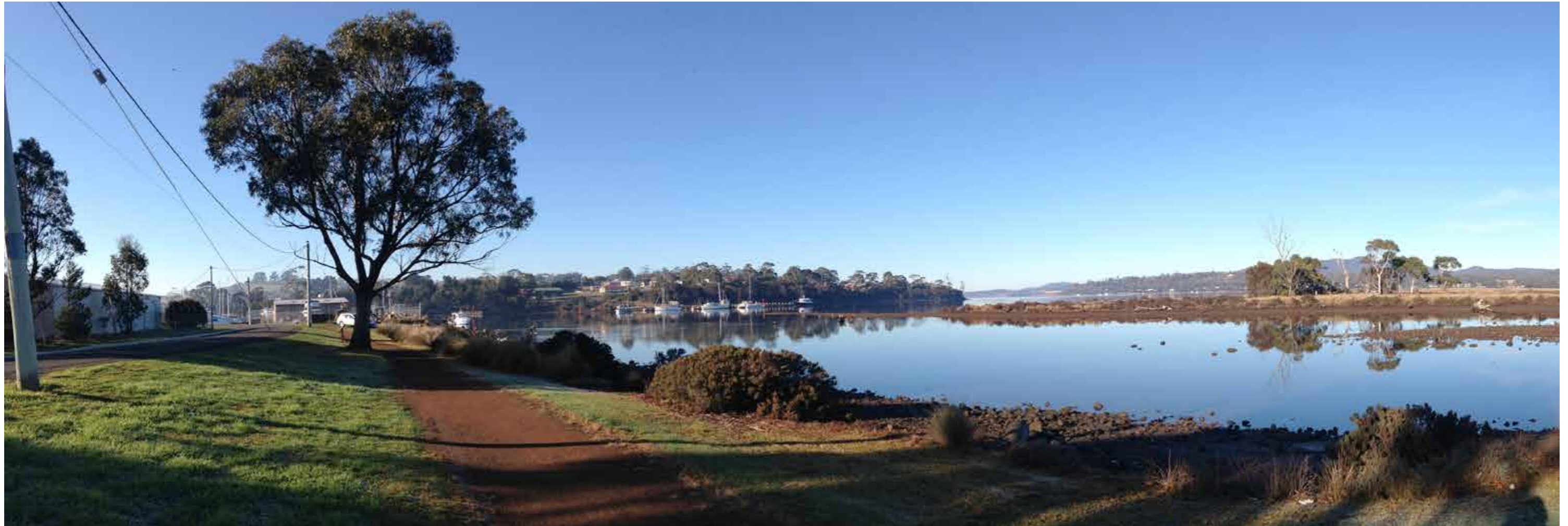
CONNECT THE GARDEN WITH THE RICH PHYSICAL AND CULTURAL LANDSCAPE OF THE TOWN AND REGION

TRIABUNNA DISTRICT HIGH SCHOOL 24 CARROT GARDENS