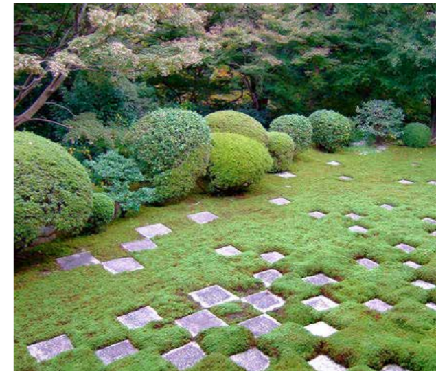
A GARDEN OF CONTEMPLATION,

TRIABUNNA DISTRICT HIGH SCHOOL 24 CARROT GARDENS